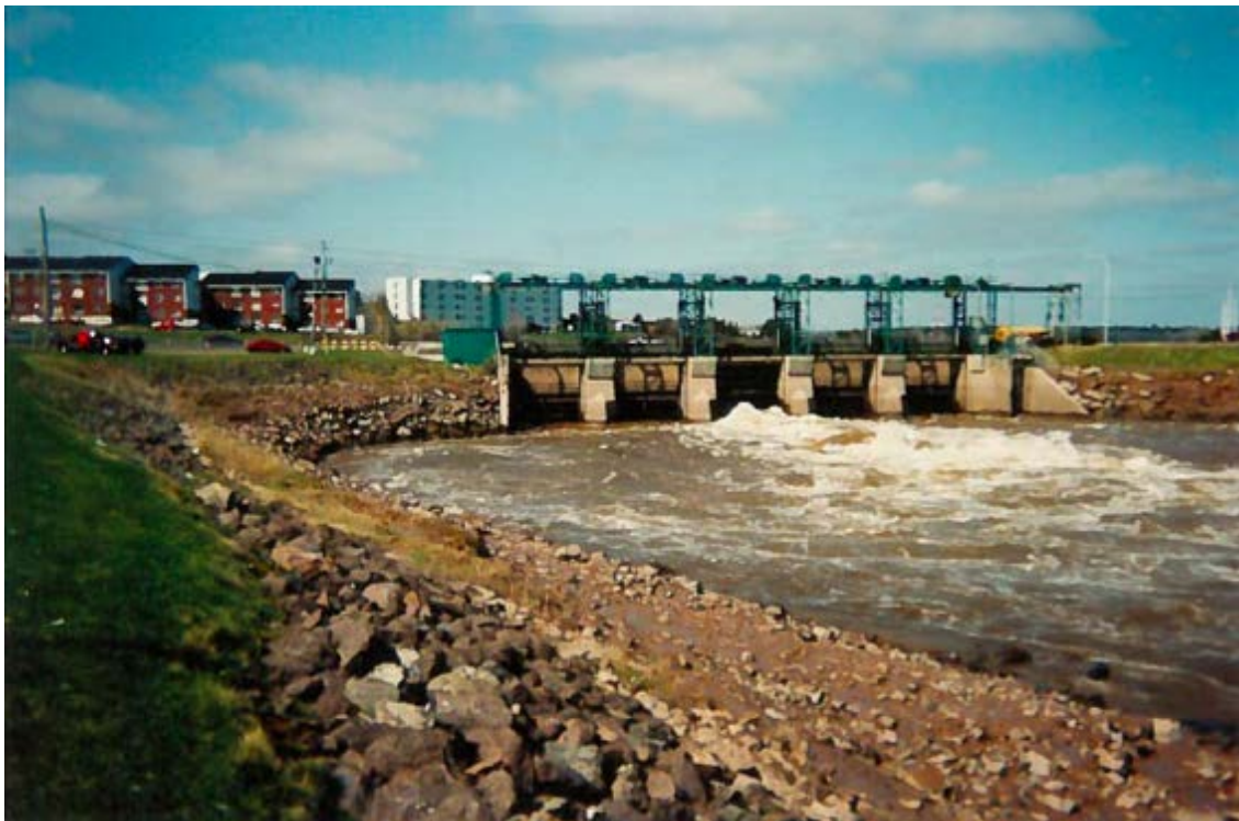
Figure 1| Petitcodiac River causeway.

In 1968, a causeway was built across the Petitcodiac River to serve as a road connection between Moncton and Riverview, New Brunswick (Figure 1). Since its construction and despite several modifications, the causeway has hindered fish passage, in addition to influencing physical processes and biophysical functions (AMEC, 2005). Following an Environmental Impact Assessment in 2005, the causeway gates were permanently opened on April 14, 2010 to restore upstream tidal exchange with the Bay of Fundy.